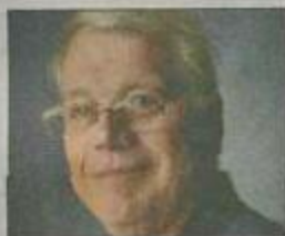
KEN HAMBLETON Journal Star Staff Writer

Open concourses. Few, if any, restricted views. Wider seats. Cup holders. Big, clean restrooms and grass playing surfaces.