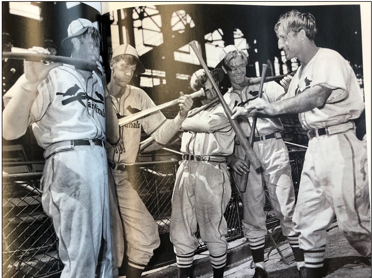
What a Gas

Okay, time to wrap up this one and send it off to the presses. I leave you now with a wonderful black and white photo from a new book I just purchased: The Story of Baseball in 100 Photographs .