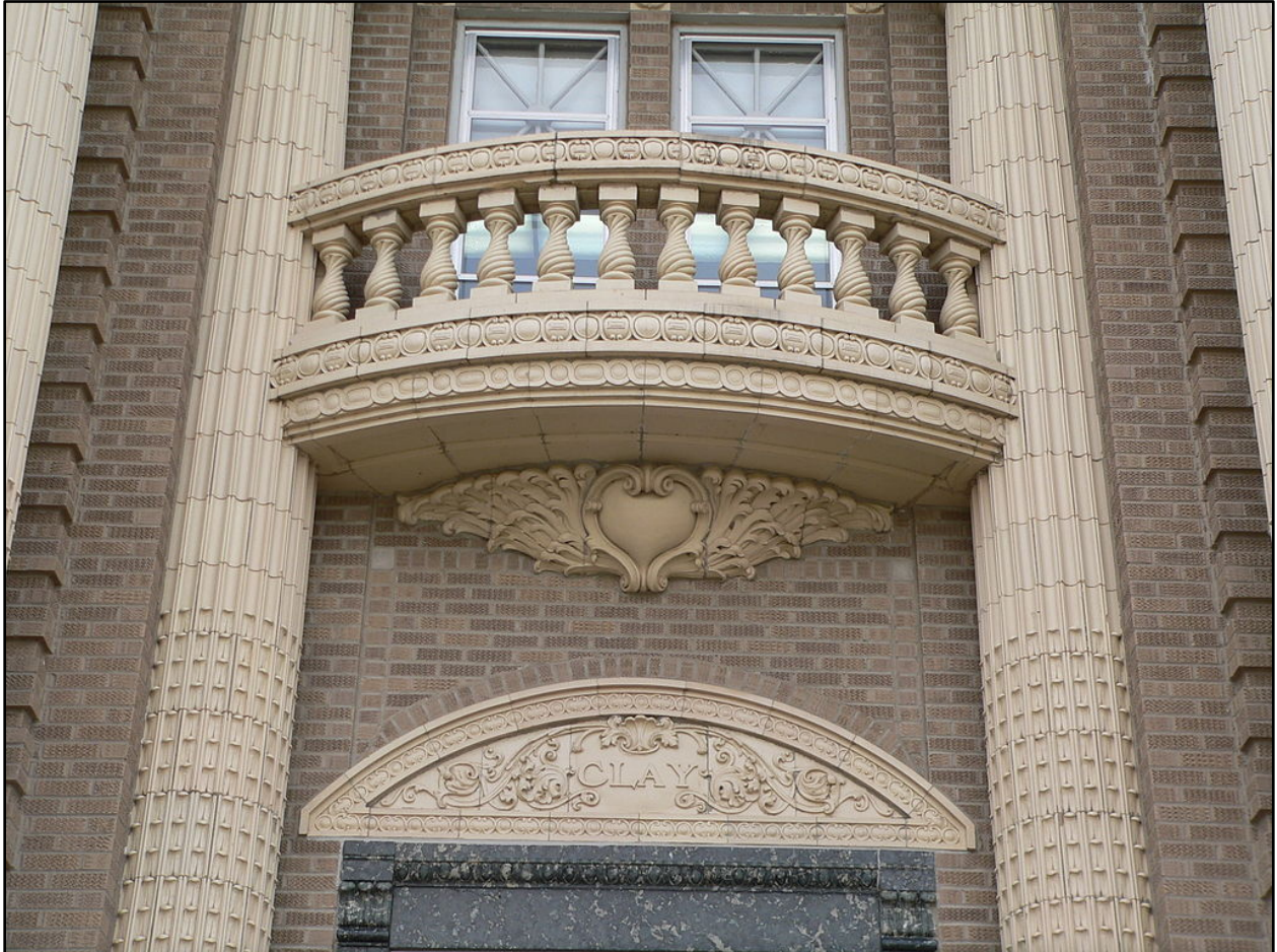
This photo shows the texture of the bricks and the intricate work on the columns and balcony. Beautiful.

The Clay County Courthouse in Clay Center, Nebraska was built during 1917–19. It was designed by architect William F. Gernandt in Beaux Arts style, and is an “exceptionally fine” example of the ten Nebraska courthouses that he designed. It is also an “excellent” example of the County Citadel type of county courthouse.