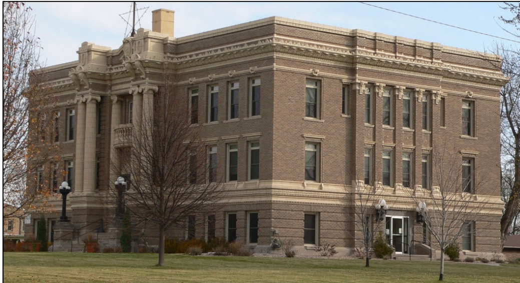
Clay County Courthouse

Erected in 1895 to replace the previous courthouse which had burned to the ground, this beautiful building, designed by a Lincoln architect, anchors the courthouse square of a beautiful and vibrant downtown Aurora. Lots of obvious civic pride in this community.