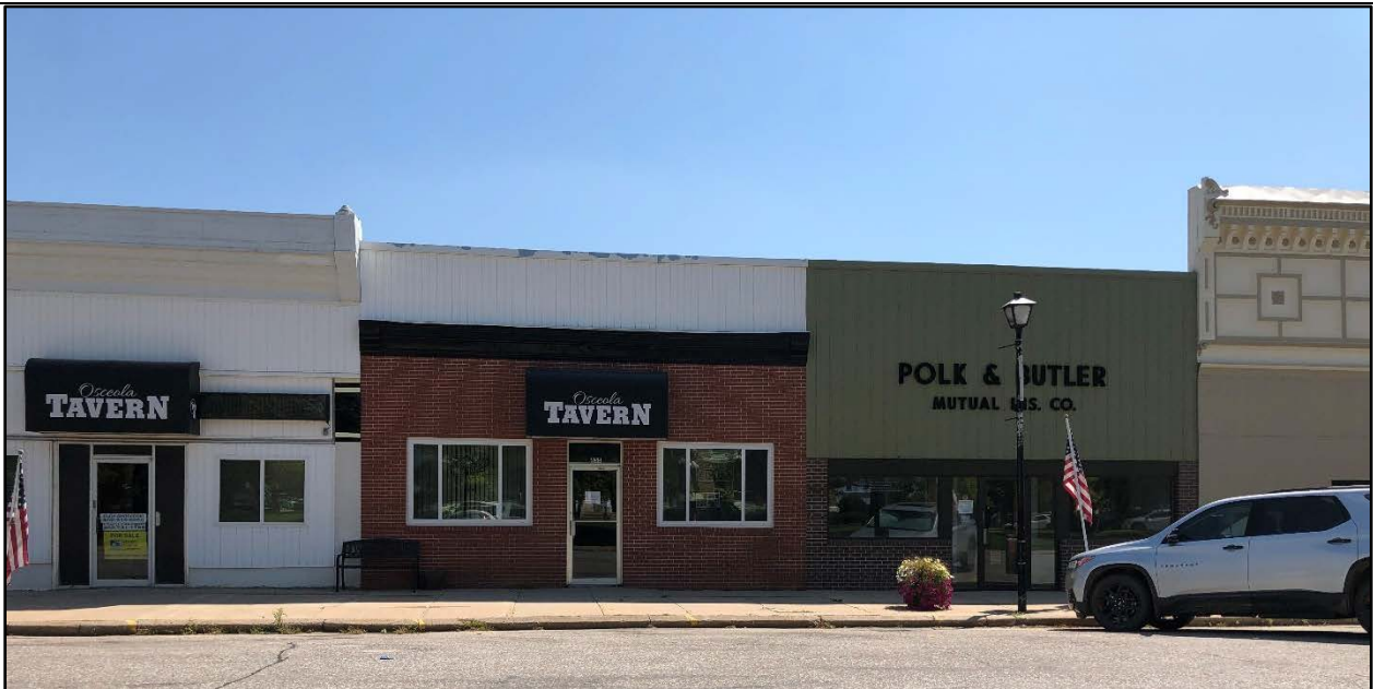
Osceola Tavern, whose patrons have heard cheers of victory and seen tears of defeat.