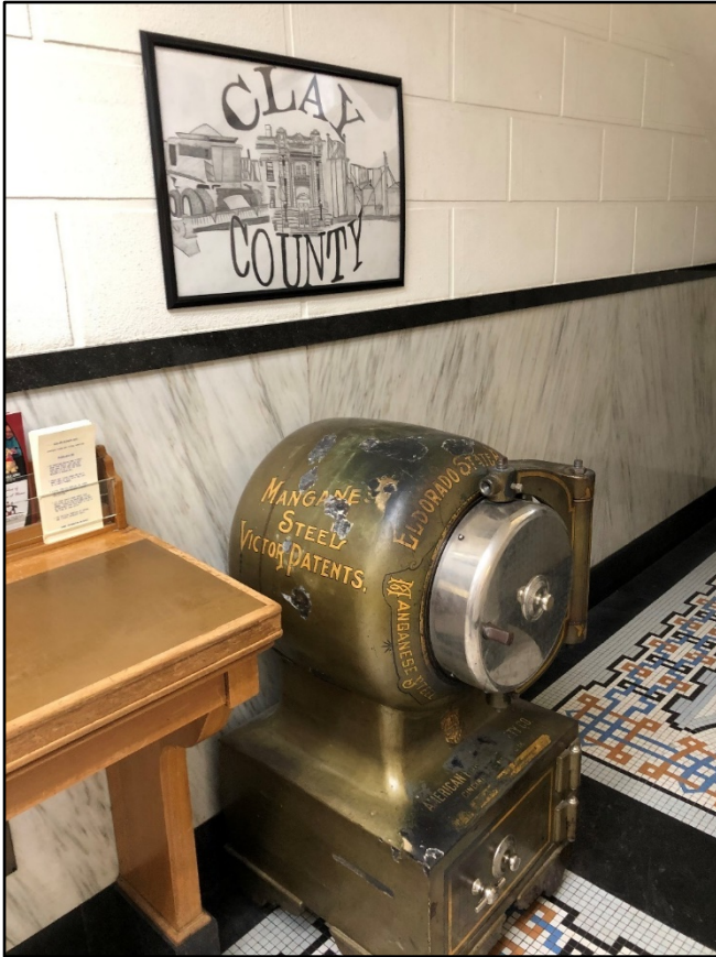
A very cool, very old safe on display in the courthouse.