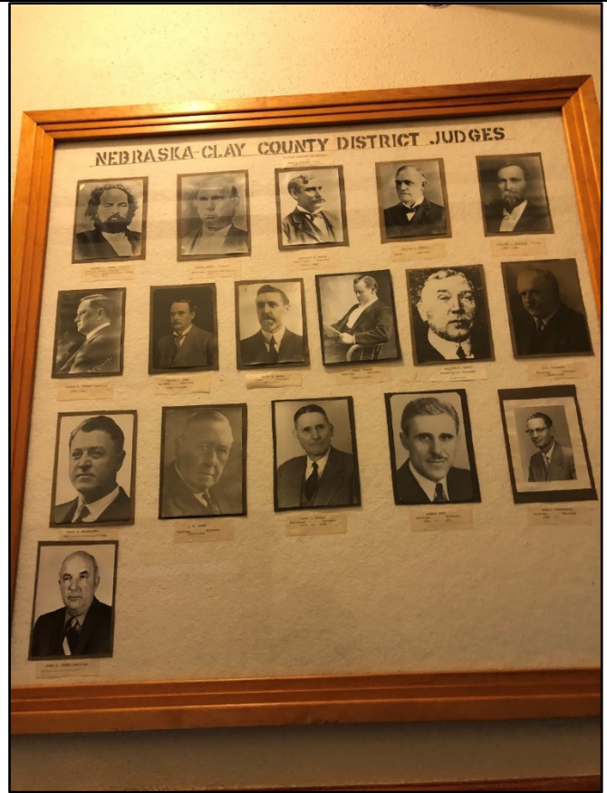
These are all of the judges who have served in the Clay County Courthouse over the years.