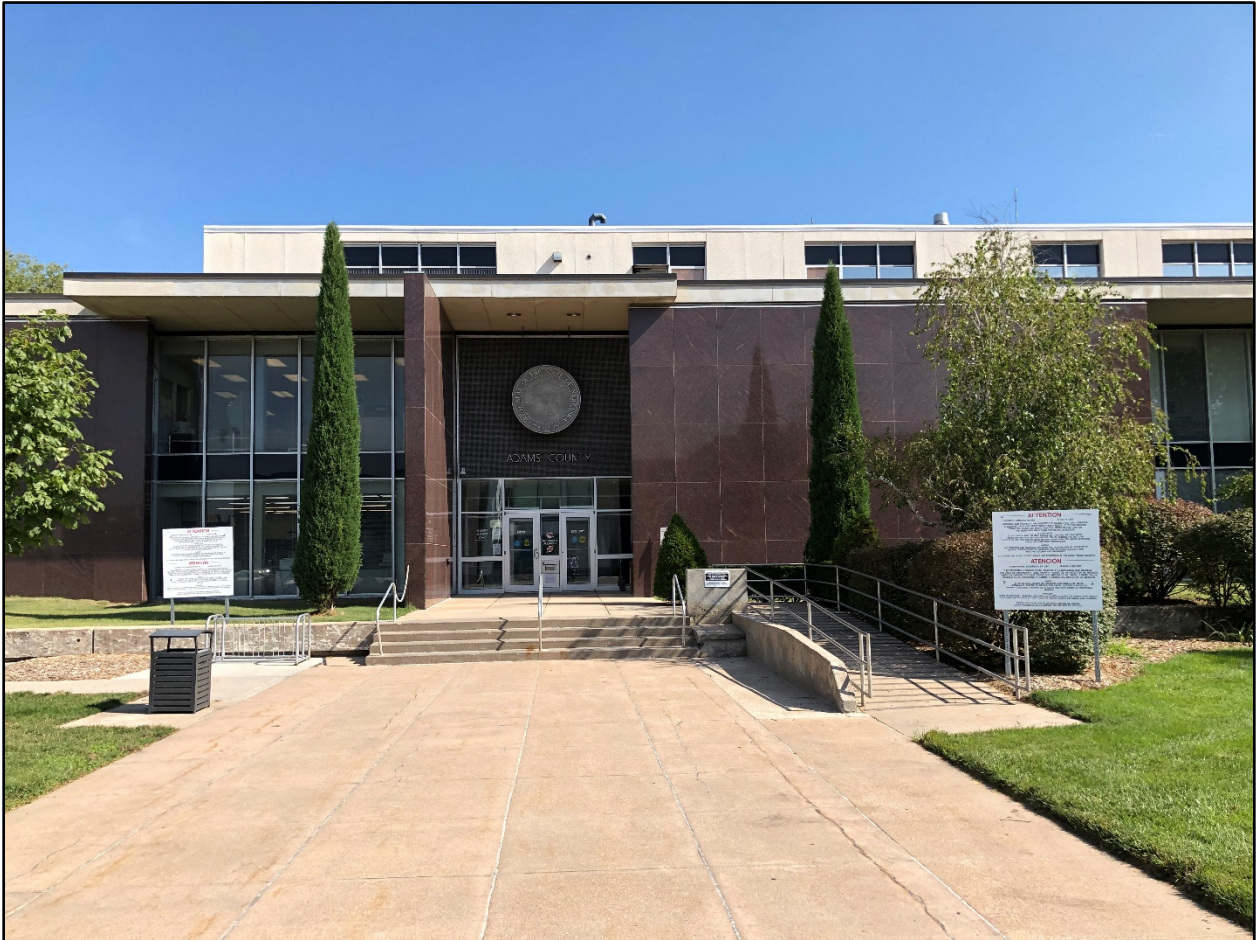
Adams County Courthouse, Hastings, NE

My third courthouse visit was to Hastings and the Adams County Courthouse. Constructed in 1961 in a style that is difficult to describe, it appears that the architect was dropping acid when he came up with this futuristic design. Not a fan. Here it is: