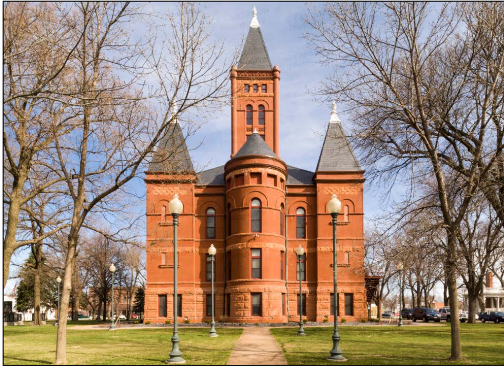
Hamilton County Courthouse, Aurora, NE