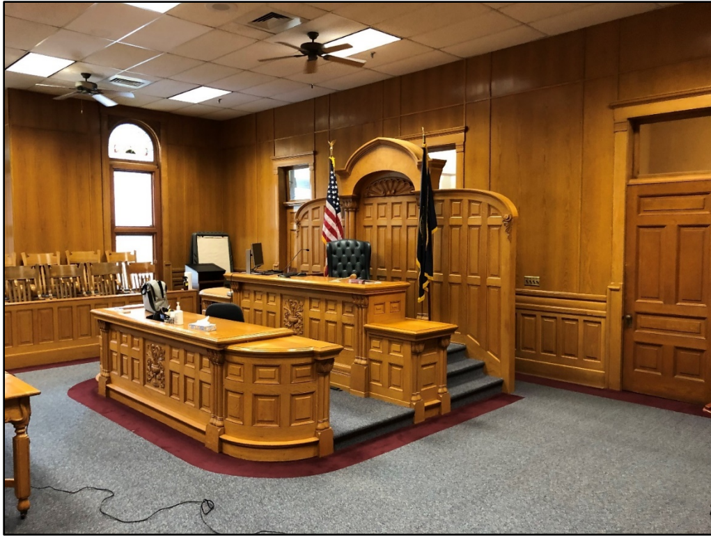
Inside the district courtroom. Very beautiful.