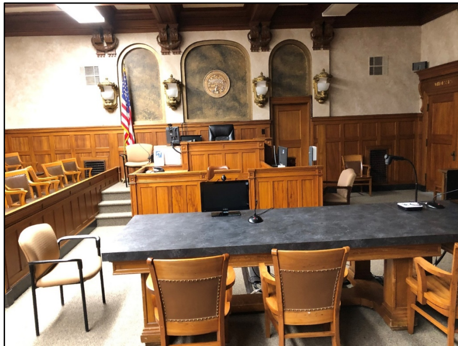
The very cool inside of the district courtroom