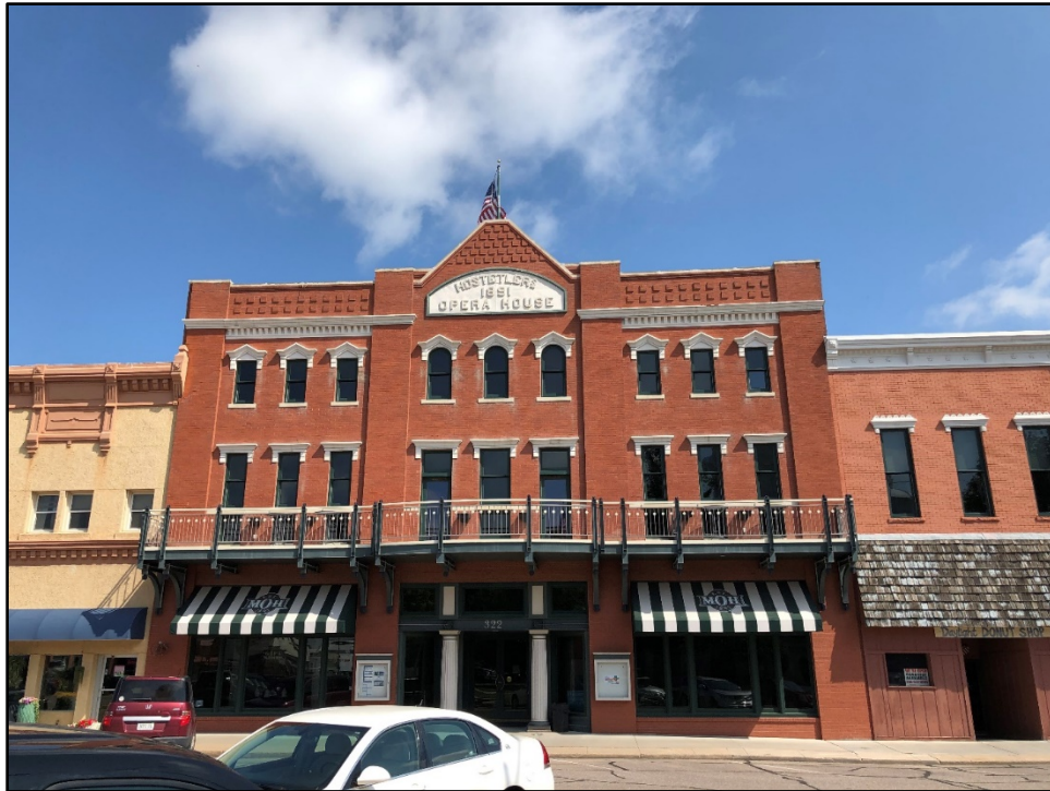
The Opera House, across the street from the courthouse.