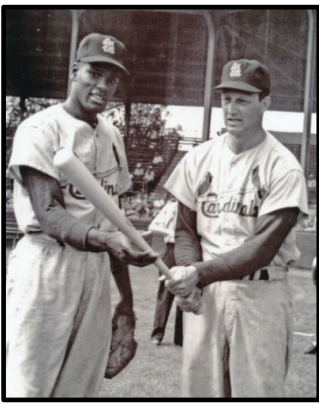
Bob Gibson and Stan Musial, Spring Training 1961, Tampa Bay