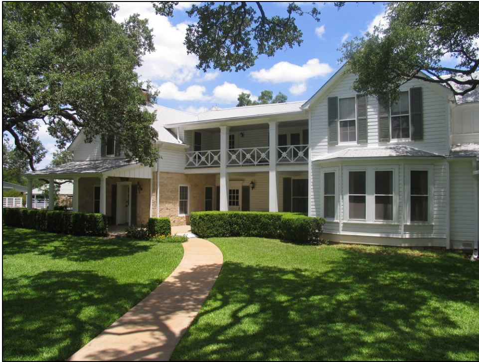
The Texas White House