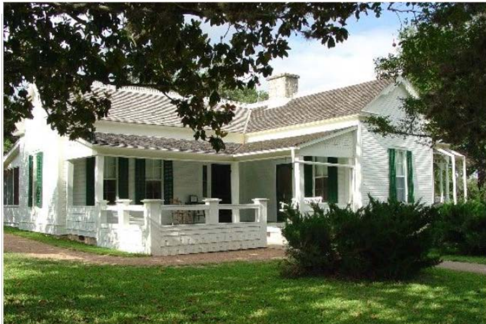
LBJ's boyhood home