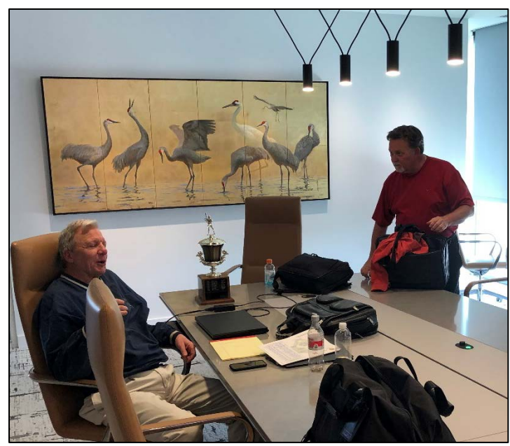
An Exhausted Commissioner CatHerder Breathes a Sigh of Relief