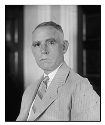
Clark Calvin "The Old Fox" Griffin