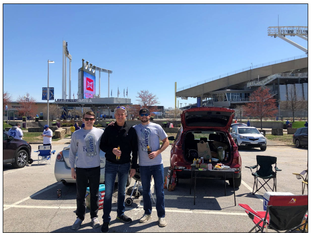
Ain't No Day Like Opening Day!

the Rangers posted 5 in the top of the first was remarkable, and having to wear masks when we weren't eating or drinking--in other words, never --was a small price to pay to be in personal attendance at a ballgame once again.