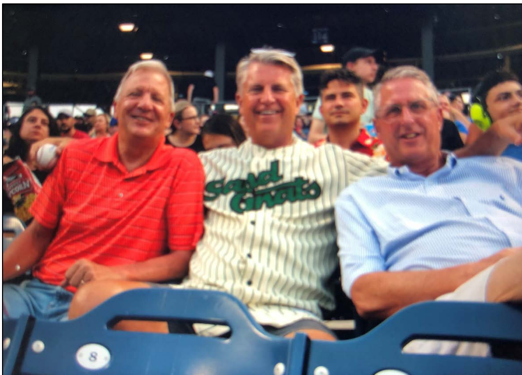
Skip and All His Friends