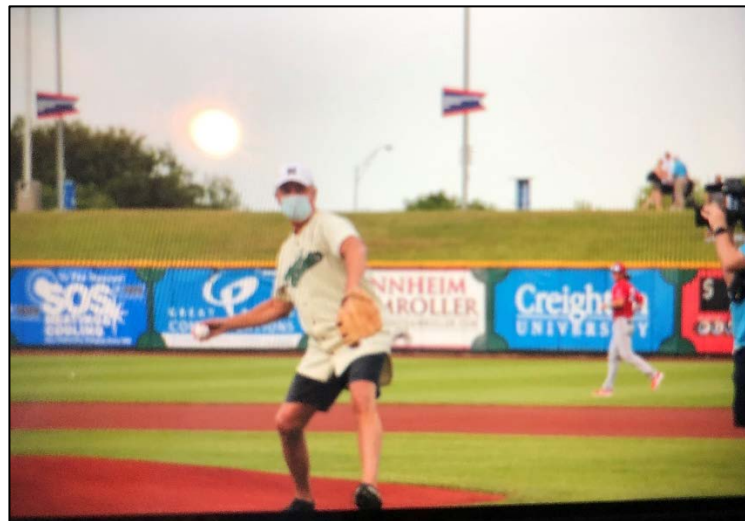
First Pitch--Nary a Hitch

As HQ and I were thinking the other day about heading out to Werner Park for one last Storm Chasers' baseball game, I was reminded of our earlier visit there back on June 19 when I got the chance to throw out the first pitch. Maybe I am repeating myself here, but I don't think that this glorious moment was ever captured in From the Bullpen , so I include herewith a few photographs from that magical night: