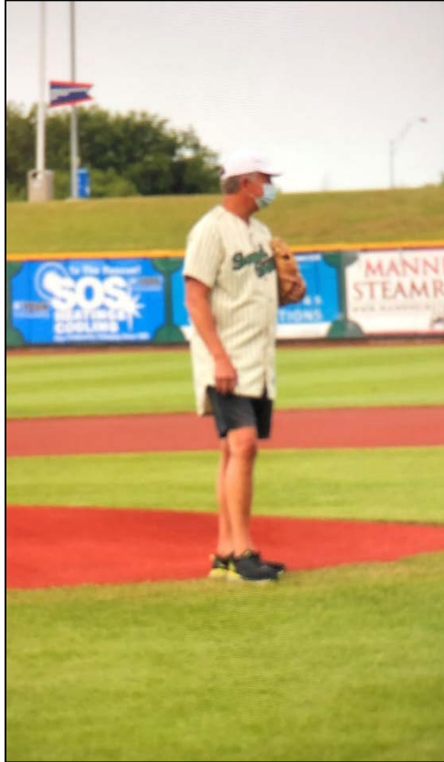
A Portrait of Study