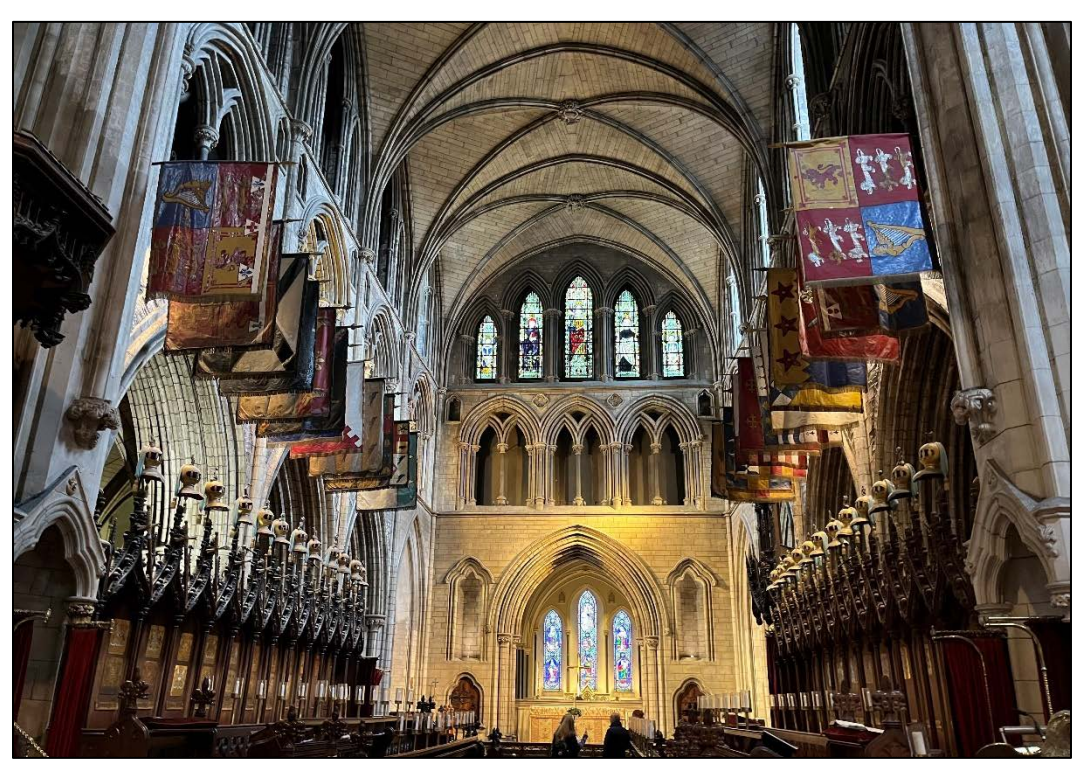
St. Patrick's Cathedral

Our last two days in Ireland were spent in Dublin, a very old and very beautiful city, with a pub a stone's throw away no matter where you are. We toured St. Patrick's Cathedral, which was built in the 1200s and is absolutely amazing,<sup>1</sup>