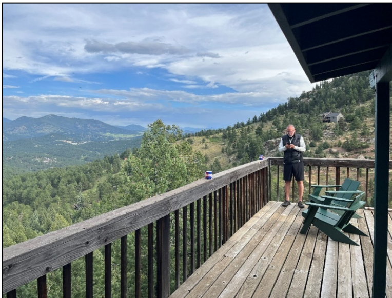
B.T.: Is this Heaven?