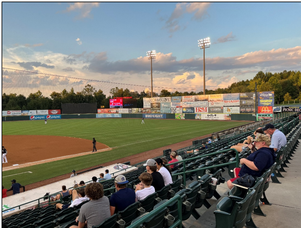
LP Frans Stadium