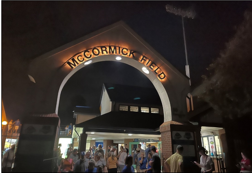
McCormick Field Entrance