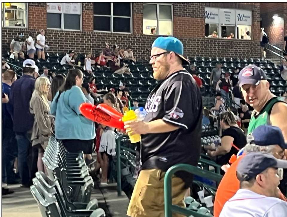
He's Here, He's There, He's Everywhere!

And of course, as on every trip, we spotted a Shamu doppelgänger, see below: