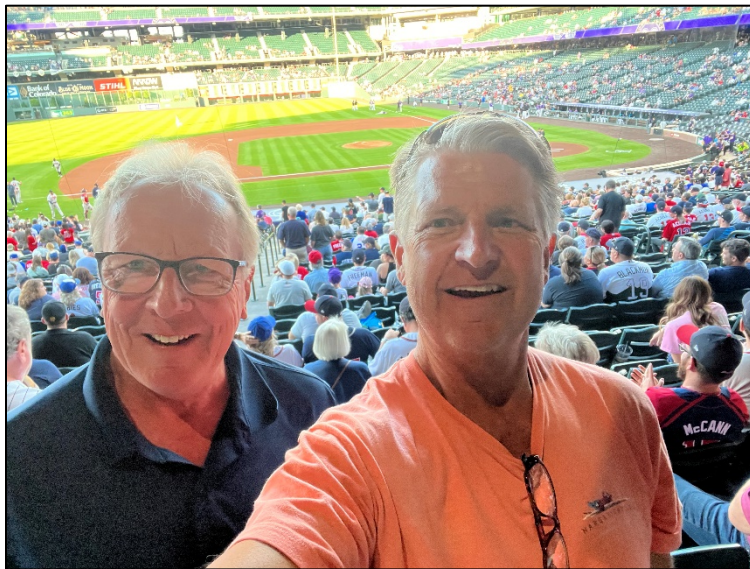
Two old Rockets Watching the Rockies

While the Rockies were able to keep the score close and only lost by the tune of 3-1, the Braves dominated the game, rapping out a total of 15 hits and threatening to score in almost every inning. In one at-bat, Acuña hit a drive to the deepest part of center field with two men on base, narrowly missing a three-run homer with the Rockies center fielder making a superb catch at the outfield fence. This prevented me from witnessing another "first," that is, the first player to have 30 or more home runs with 60 or more stolen bases in the same season, since Acuña entered the night with 29 home runs. Of course, he will get there soon enough and could even end up being a 40/75 guy, which is insane.