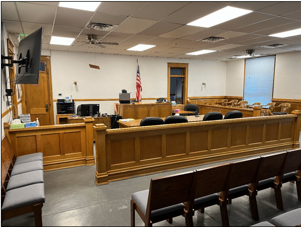
One of the few Courthouses POTUS 45 hasn't been in. Yet.