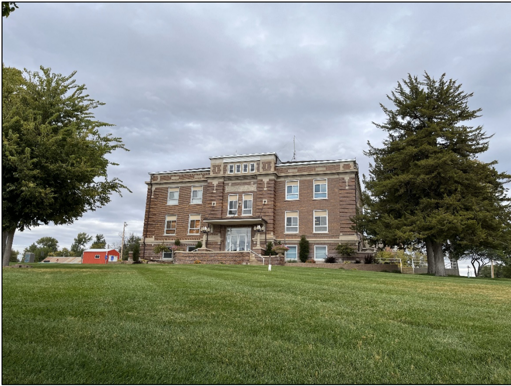
93 and Me