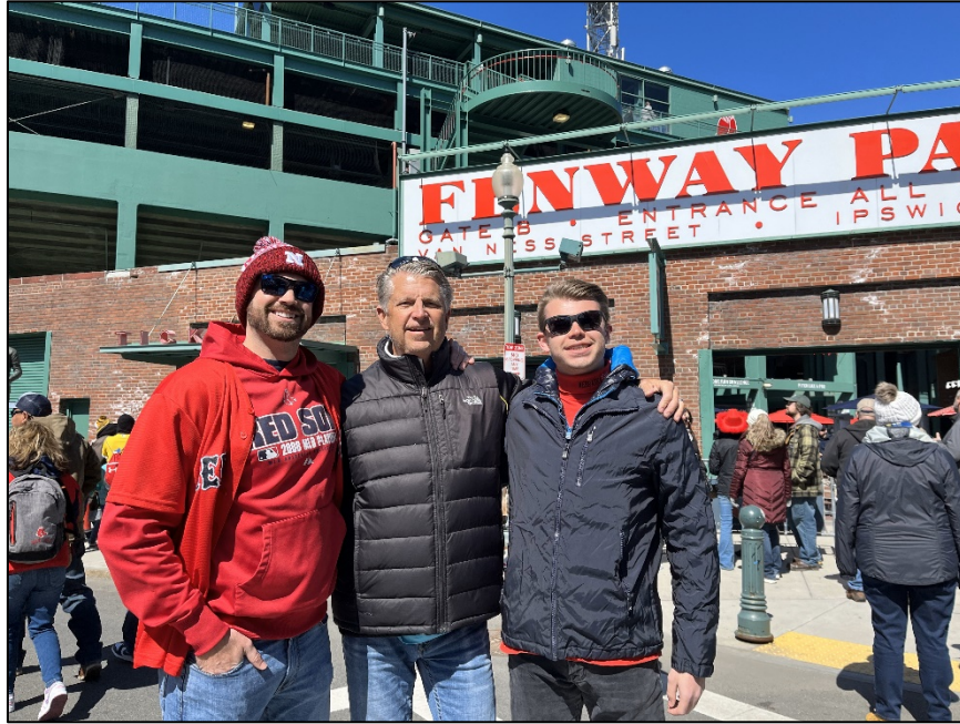
Heaven on Earth