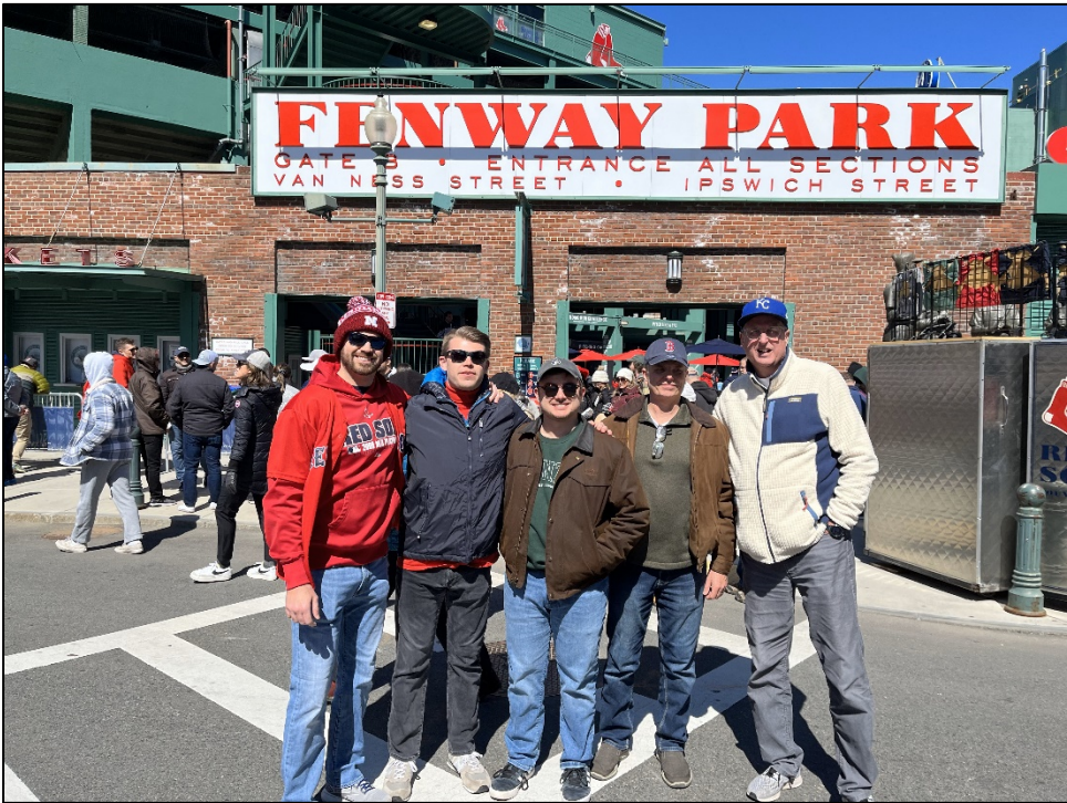
No Better Place to Be!