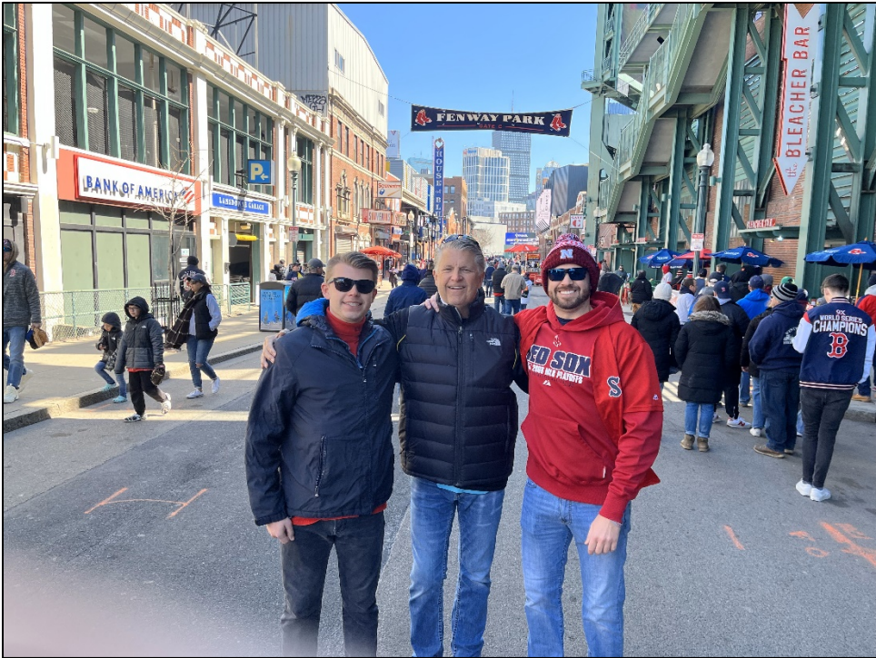
No. 20 for the Ernst boys

A couple of pictures will help tell the story.