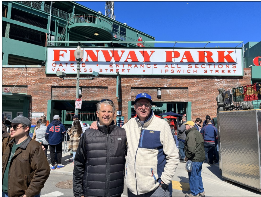
Skip 'N' Stretch