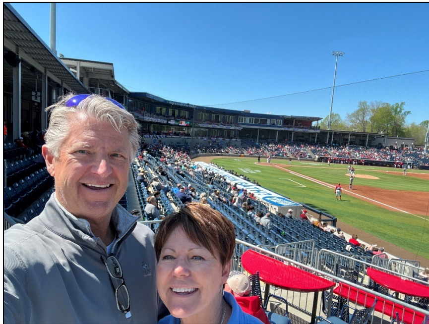
What Better Place to Spend Easter Sunday?