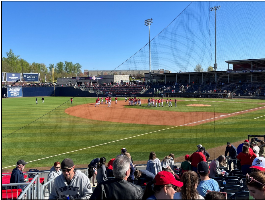
Nats Celebrate Walk-off Win