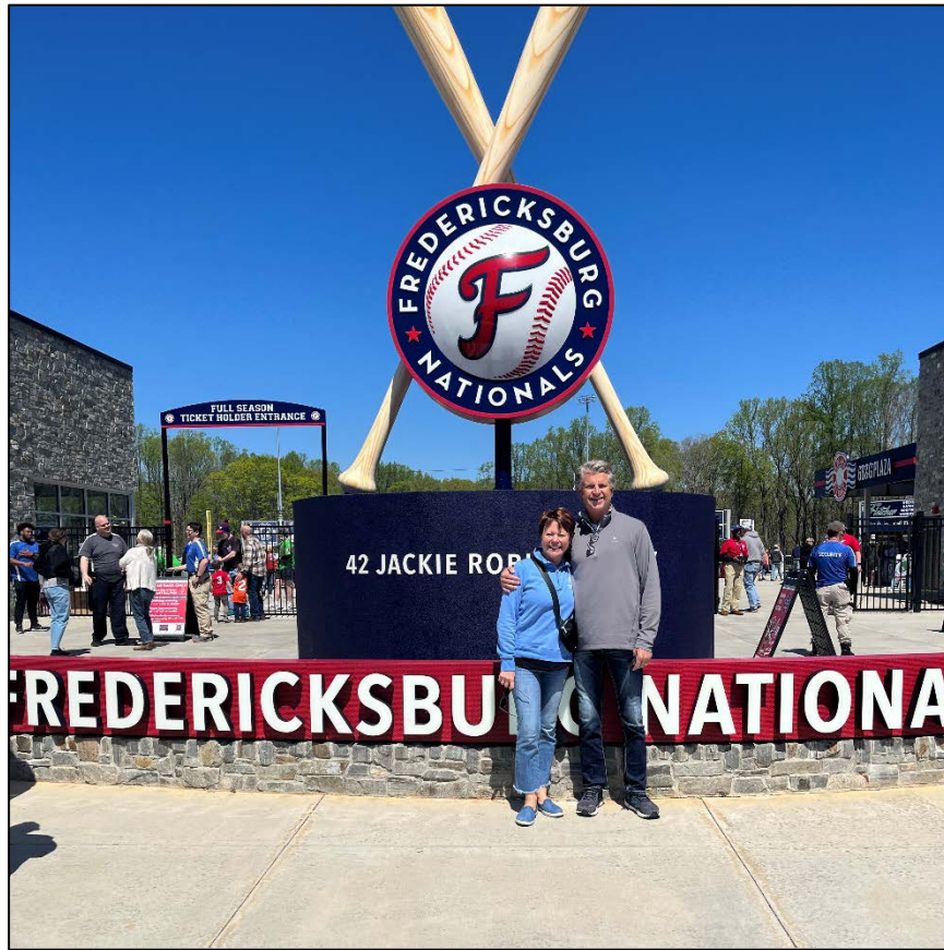
Virginia Credit Union Stadium